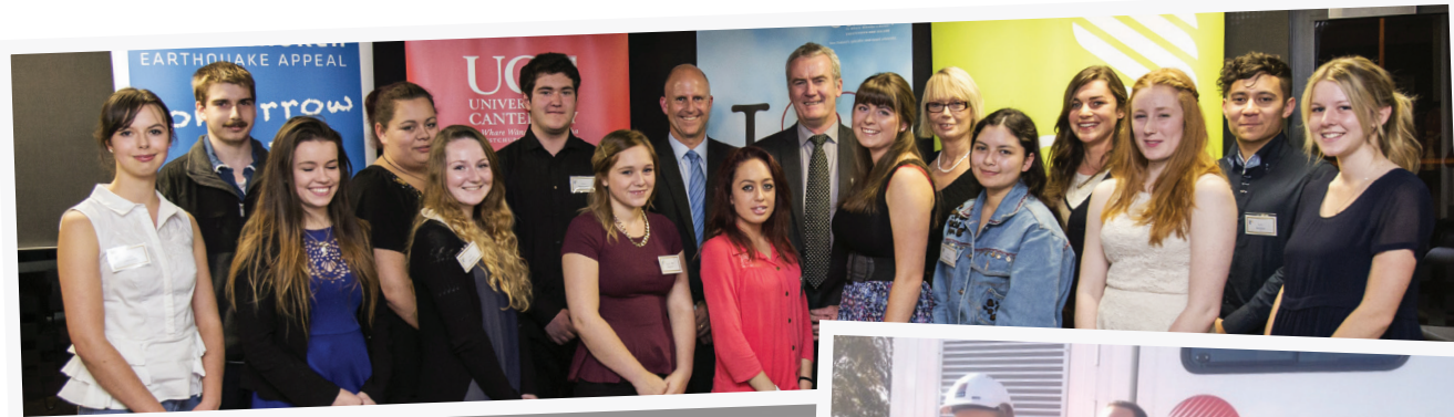
Twenty new earthquake scholarships have been awarded to first-year tertiary students with $170,000 to Bright Start.

Donations to the Christchurch Earthquake Appeal have paid for hundreds of recovery projects in greater Christchurch, Kaiapoi and Rangiora over the past two and a half years.