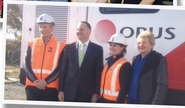
Prime Minister John Key in Kaiapoi as work started to restore public amenities on the riverbank with $2 million from the Appeal Trust.