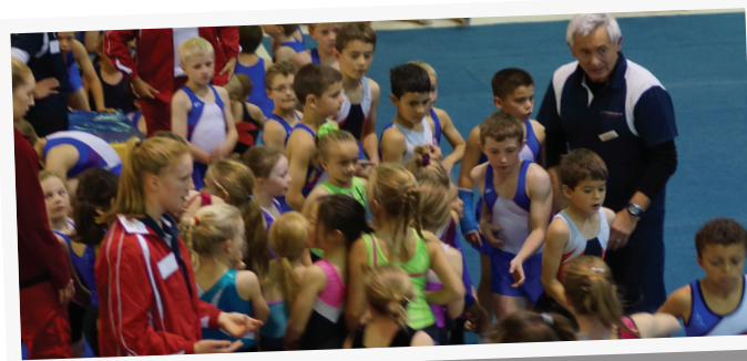
The Gymnastics Centre at QEII reopened its older gymnasium, strengthened with $100,000 from the Appeal Trust and NZCT.

To date the Christchurch Earthquake Appeal has raised more than $100 million in pledged and received funds. Trustees have approved more than $62 million for recovery projects, while a further $7 million has been pledged for specific purposes and projects.