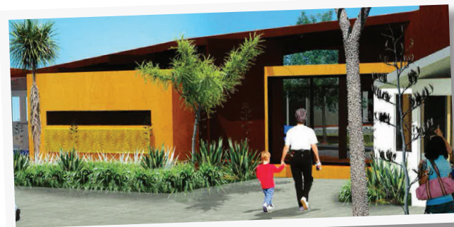
Rebuilding Cholmondeley Children's Home is being helped with $550,000 from the Appeal Trust.