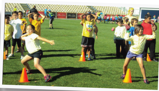
Children enjoy a Sport Canterbury event at AMI Stadium. Appeal Trust funding ensures the stadium is available for communities.